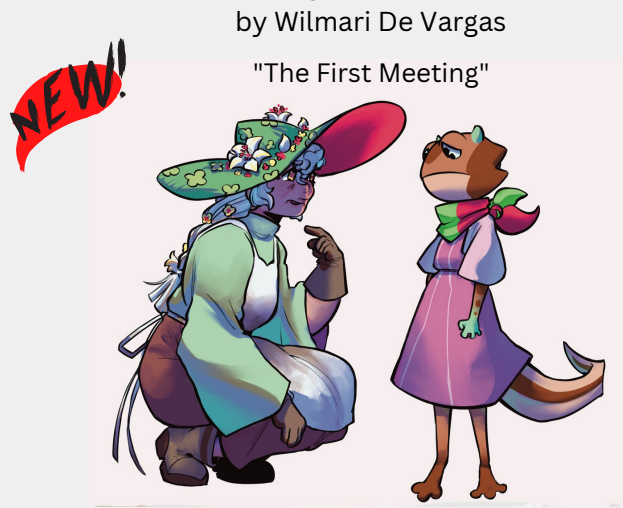
Stay tuned for more comics by Wilmari!